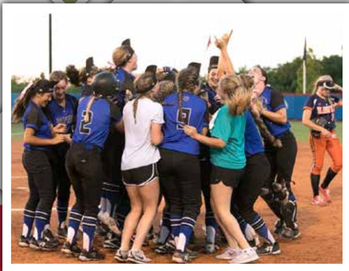
Olathe Northwest 2017 6A Girls Softball State Champions