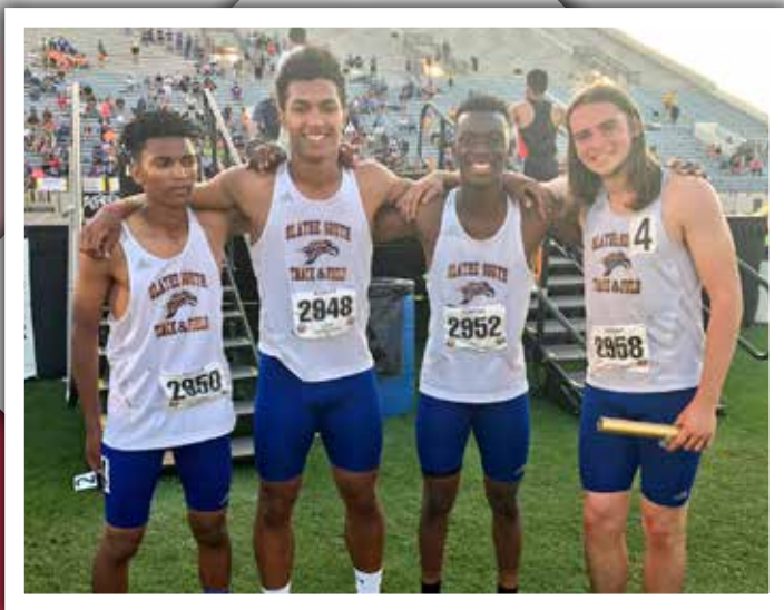
Olathe South 2017 6A Boys 4x400-meter relay State Champions