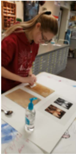
AP Studio Art 2-D

** It is our recommendation that students complete at least TWO courses in a media area , prior to enrolling in an AP course **