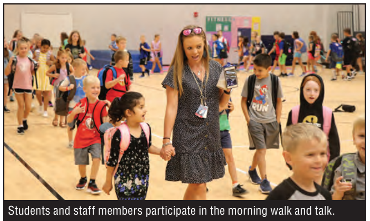
Students and staff members participate in the morning walk and talk.

Canyon Creek serves as Olathe’s first elementary built with a makerspace in the original plans. Makerspaces are large areas with moveable furniture that can allow for large-scale collaboration and experiential learning.