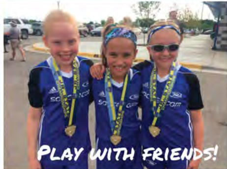
PLAY WITH FRIENDS!

NON-PROFIT, PROVIDING OPPORTUNITIES FOR YOUTH TO PLAY SOCCER FOR OVER 38 YEARS