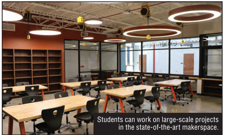
Students can work on large-scale projects in the state-of-the-art makerspace.