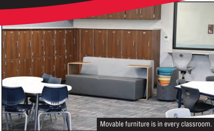
Movable furniture is in every classroom.